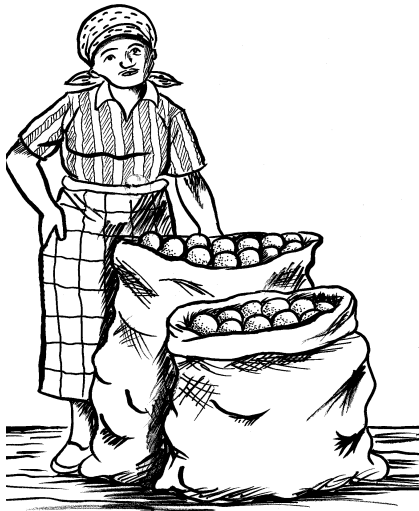
Harvested fruit packed in sacks